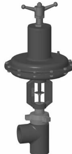
Figure 3. Model 5400 with Manual Override Handwheel

For applications requiring an adjustable travel stop, or a ready means of positioning the valve in an emergency, the Model 5400 can be equipped with a top-mounted handwheel. The handwheel, shown in Figure 3, is available only on size 70, reverse-acting (fail-close), open yoke style (Model 5400) actuators.