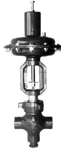
Figure 1. Model 5400 open yoke control valve