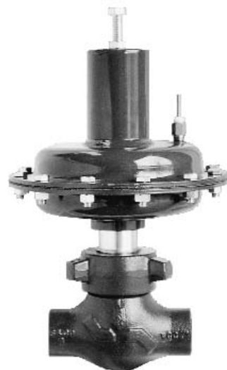
Figure 2. Model 5450 close-coupled control valve